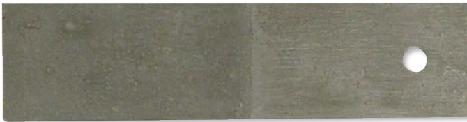
Magnesium exposed to an approved fixed-tank helicopter product.