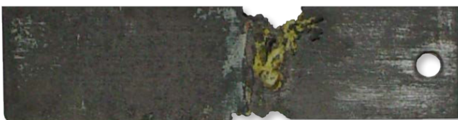
Magnesium exposed to a non-approved product.