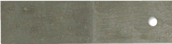
Magnesium exposed to an approved fixed-tank helicopter product.

Gel should be targeted for direct suppression or structure protection.