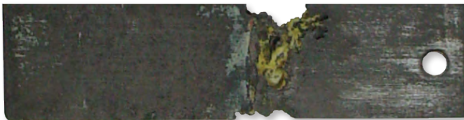
Magnesium exposed to a non-approved product.